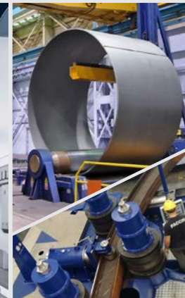
PLATE & PROFILE FORMING